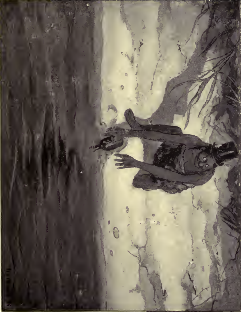
A BLACK PERSON BY THE NAME OF FRIDAY FINDS A BOTTLE